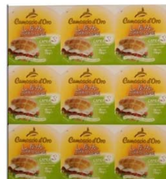
Plate: MacDermid Printing Solutions' Digital Rave Printed Job: Camoscio Doro Capra Company: Sac Emballage Trade Shop: Flexocolor Press: Schiavi Ink: Siegwerk Anilox: Harper Tape: Scapa