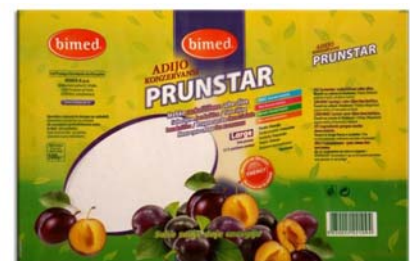
Plate: MacDermid Printing Solutions' Digital Rave Printed Job: Pruneaux Bimed Company: BRJ Emballage Trade Shop: Socoreg Press: Comexi Ink: Sun Chemical Anilox: Praxair Tape: Tesa