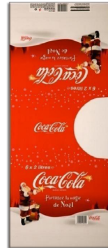
Plate: MacDermid Printing Solutions' Digital Rave Printed Job: Coca-Cola Company: Barber Group Trade Shop: Flexocolor Press: Windmoller Ink: Flint Group Anilox: Praxair Tape: Lohmann