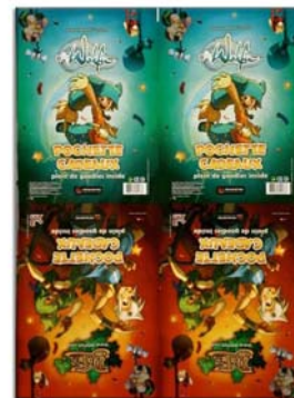
Plate: MacDermid Printing Solutions' Digital Rave Printed Job: Sachet Goodies Company: BRJ Emballage Trade Shop: Flexocolor Press: Comexi Ink: Sun Chemical Anilox: Praxair Tape: Tesa